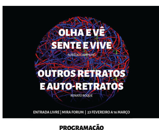
Photo exhibition presents an overview of the Carnegie Mellon Portugal Project SCREEN DR